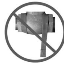
(A) Incorrect Installation: Heating tape hanging free from the surface