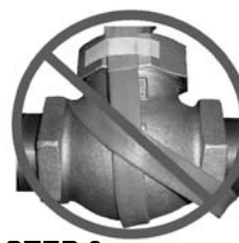
(C) Incorrect Installation: Heating tape overlapped on itself