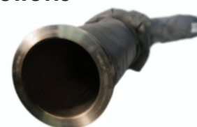
Cloth Jackets and Insulators