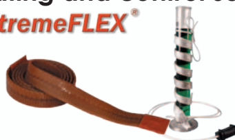
Flexible Heating Tapes